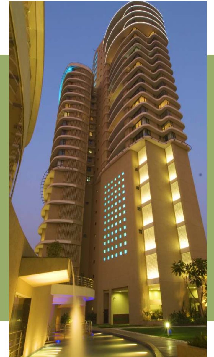
Kalpataru Horizon, Mumbai

Winner- CNBC Awa CRISIL Real Estate Award 2007